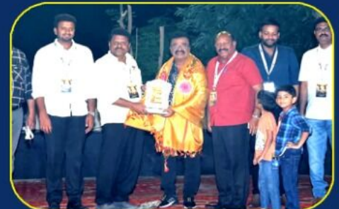
Actor VTV Ganesh