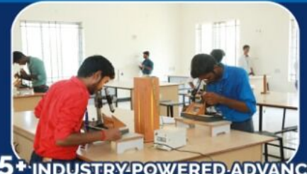
45+ INDUSTRY-POWERED ADVANCED LABORATORIES