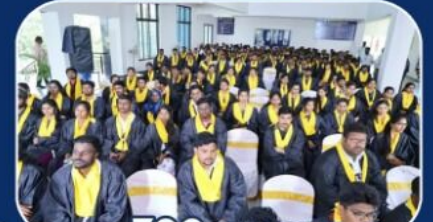
700 CAPACITY AUDITORIUM & SEMINAR HALLS