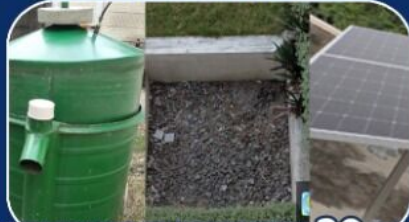
ECO FRIENDLY CAMPUS WITH 30 RAINWATER HARVESTING SYSTEM, SOLAR & BIOGAS