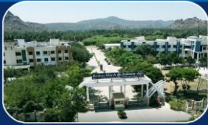
30 ACRES CAMPUS