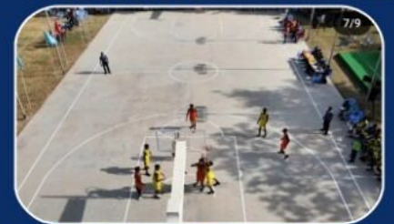
EXCELLENT SPORTS INFRASTRUCTURE