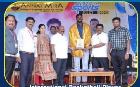
International Basketball Player Aravind Annadurai