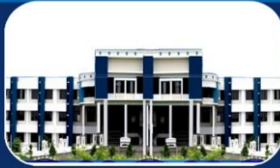
2.5 LAKHS SQ.FT BUILDINGS