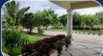
LUSH GREEN CAMPUS WITH MORE THAN 500 TREES