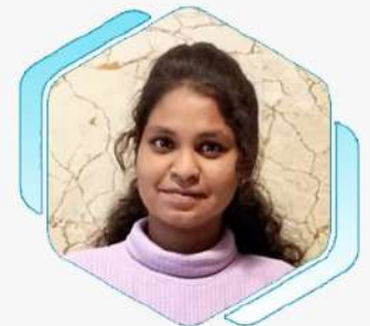
BOOMICA R / EEE Graduate Engineer Trainee