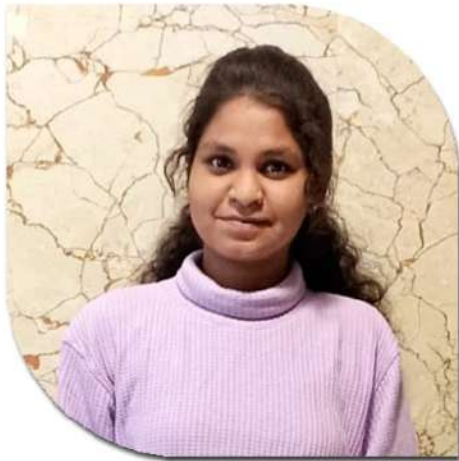
BOOMICA R EEE