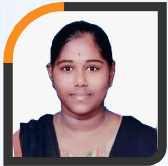
LOGANAYAKI K MECH